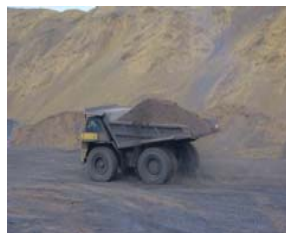
Transportation by dumper